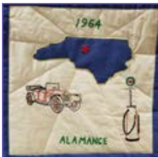
Quilt block made by Alamance Chapter members.