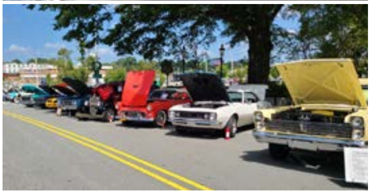
2021 Car Show