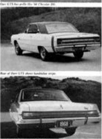
October 1967 Car and Driver photo feature of the Dodge lineup for 1968 shown above is courtesy of Rick Holmes.