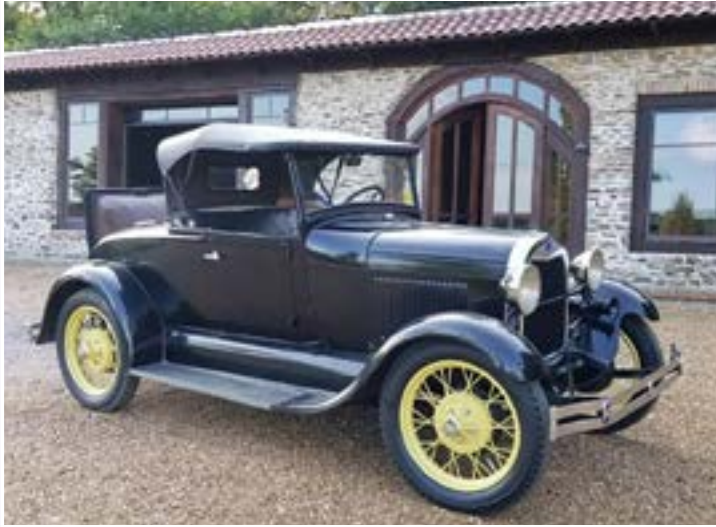
The Getaway Roadster awaits being pressed into service once again.