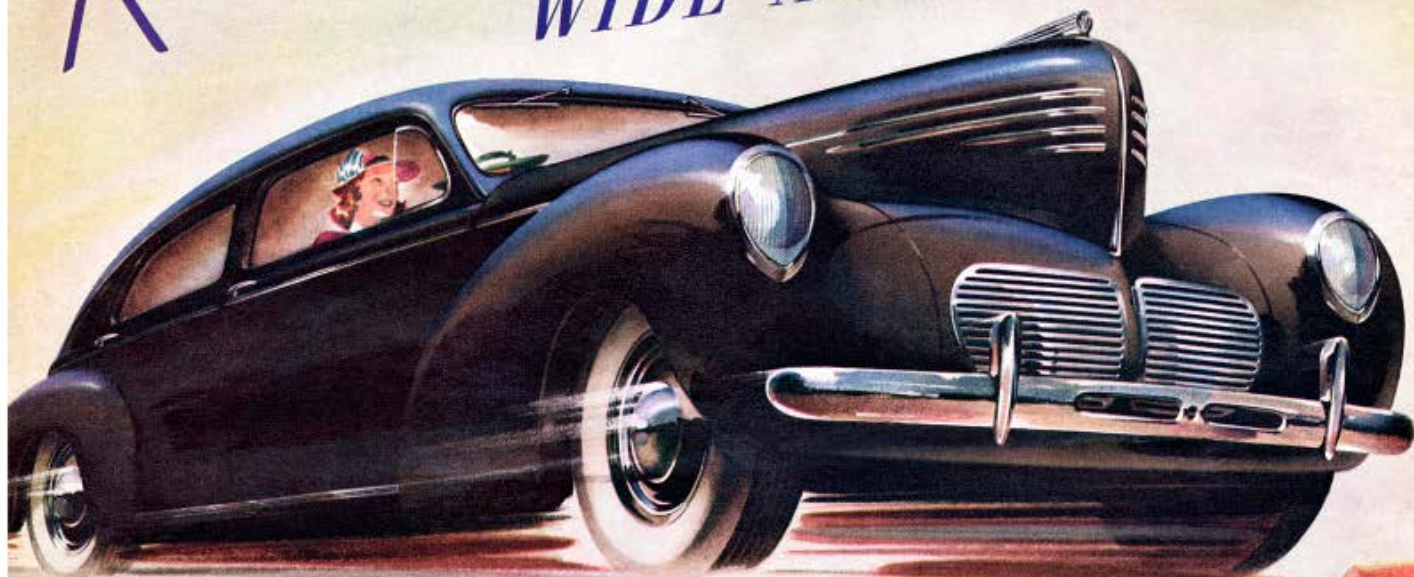
Four-Door DeLuxe Sedan Illustrated $620*