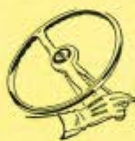
NEW STEERING-POST GEARSHIFT

* Standard equipment on all DeLuxe models.