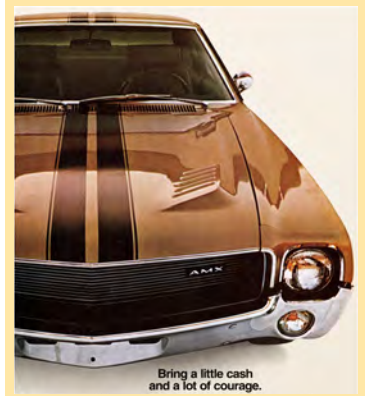
Bring a little cash and a lot of courage.

September 8, 2018 at 6:30pm ACA Clubhouse, Burlington, NC