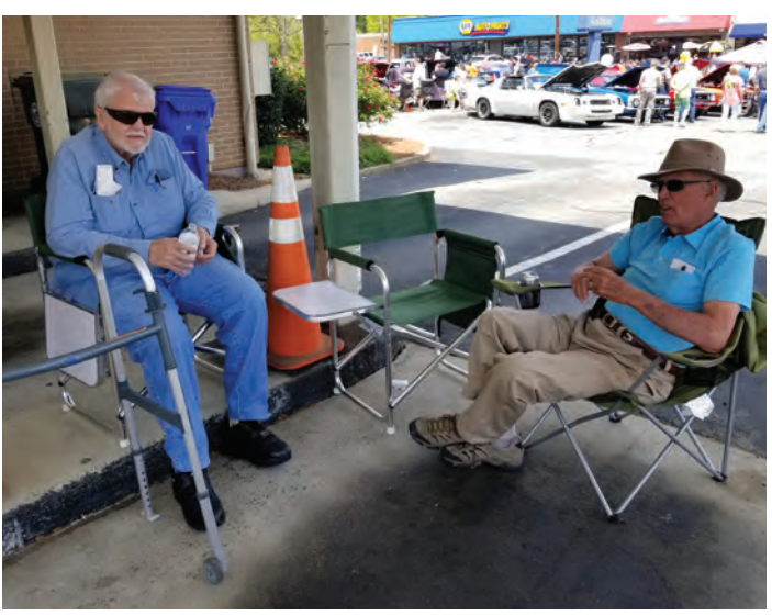
Look for car show photos in next month's Weak Spark!