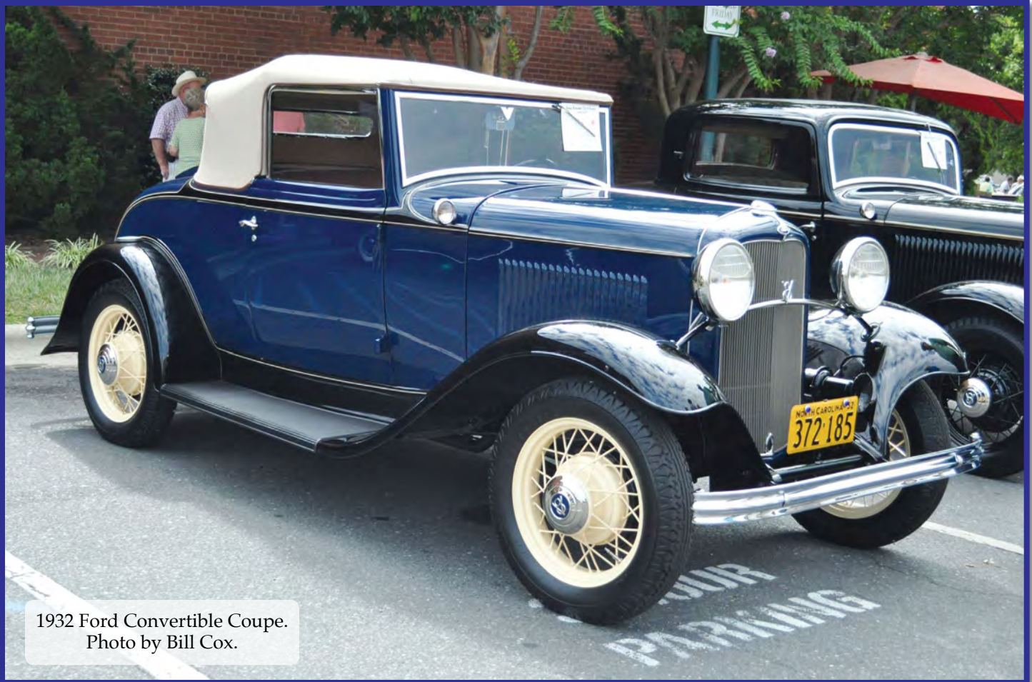
1932 Ford Convertible Coupe.

Alamance Region AACA PO Box 565 Mebane NC 27302