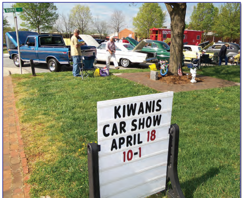
Photos from the Gibsonville Kiwanis Car Show.