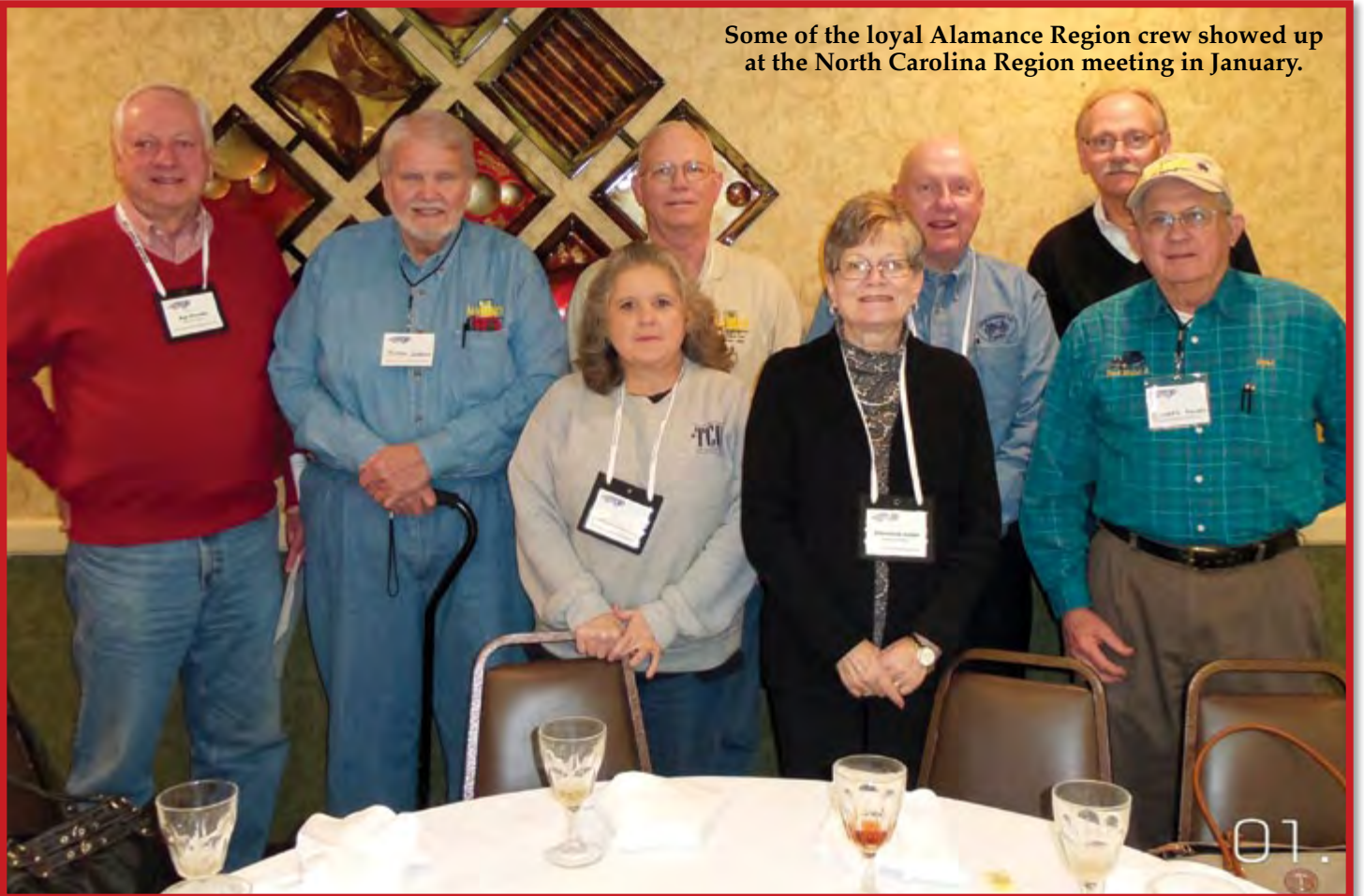
Some of the loyal Alamance Region crew showed up at the North Carolina Region meeting in January.

Alamance Region AACA PO Box 565 Mebane NC 27302