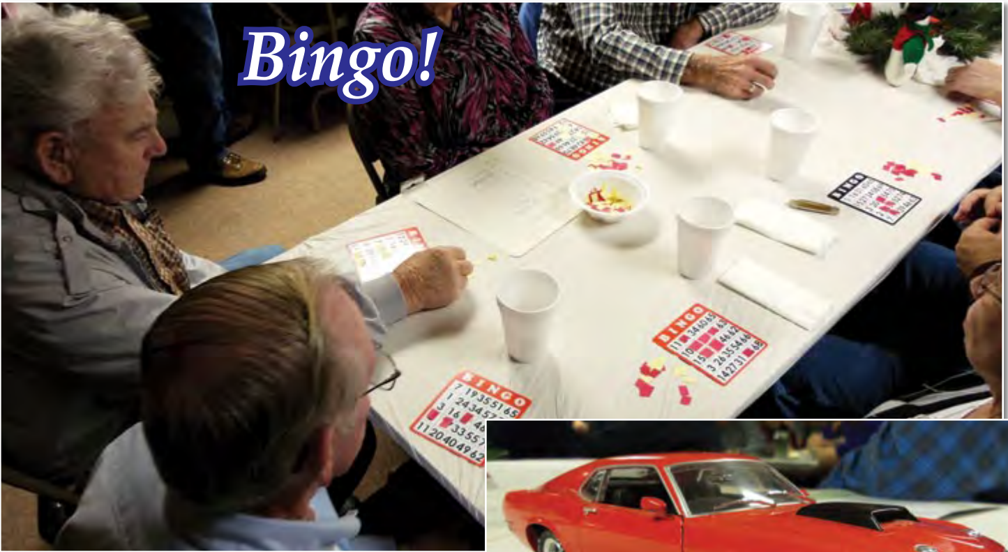
Bingo stakes were high and hotly contested as they included potential ownership of this 1970 Boss 429 Mustang reportedly worth tens of dollars!