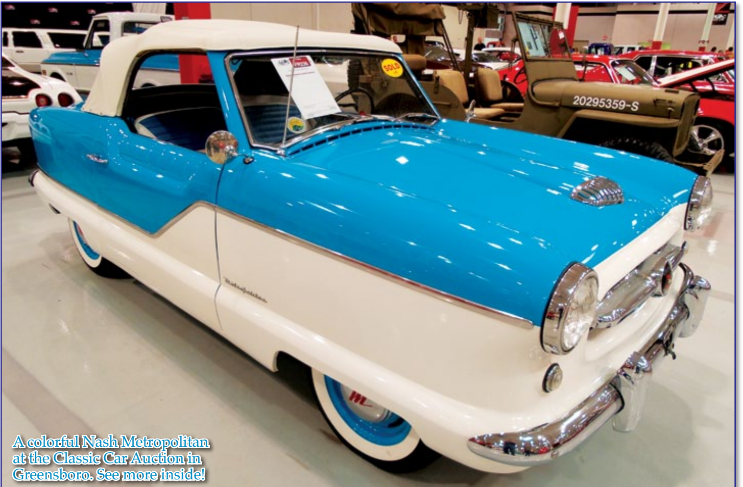
A colorful Nash Metropolitan at the Classic Car Auction in Greensboro. See more inside!

Alamance Region AACA PO Box 565 Mebane NC 27302