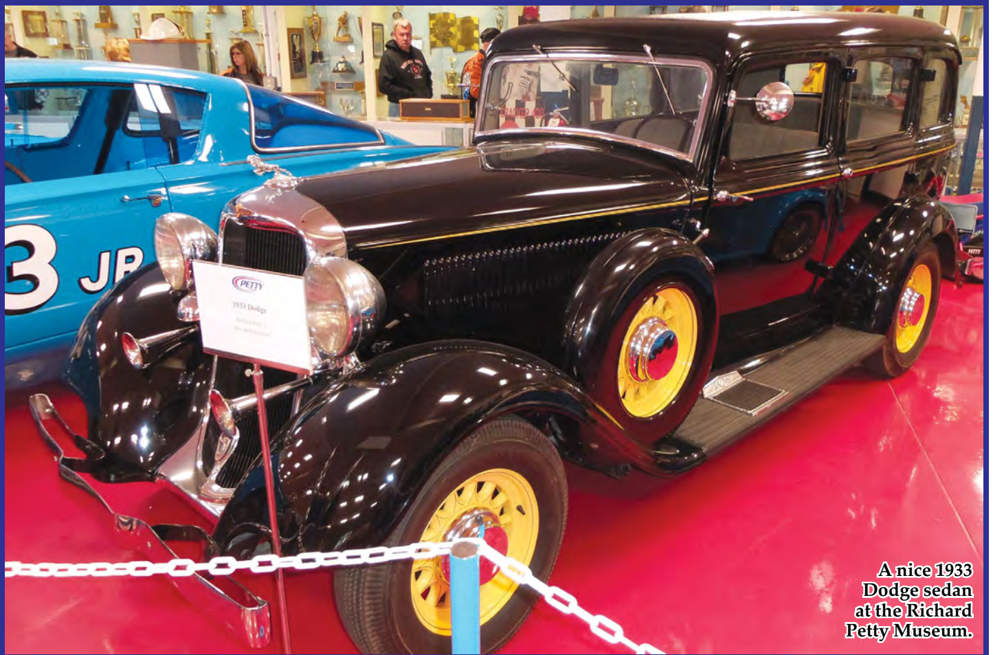
A nice 1933 Dodge sedan at the Richard Petty Museum.

Alamance Region AACA PO Box 565 Mebane NC 27302