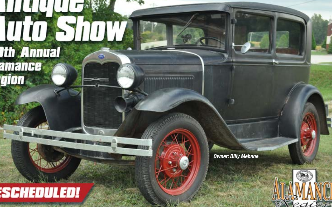
Owner: Billy Mebane

At the Historic Railroad Depot in Downtown Burlington 200 South Main Street Burlington, NC 27215