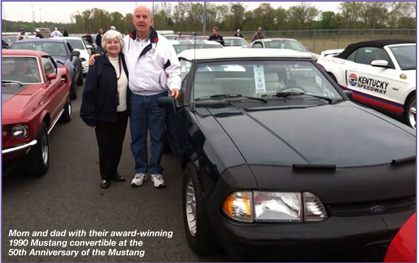
Mom and dad with their award-winning 1990 Mustang convertible at the 50th Anniversary of the Mustang

B efore I begin I want to say a special thank you to my Alamance Region AACA family for all the prayers, cards, thoughts, and visits to my Mom in Hospice and being at her service. You cannot know how special you all are to myself and my family. Though this has been a very hard time for us, the fact that you truly cared keeps us going every day. My Mom is truly healed and now lives in our Father's House waiting on us to join her someday. Thanks again for all you did for us...we will be forever grateful.