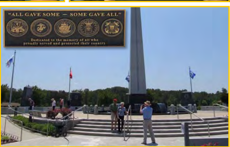
Photos of the Saturday May 25th Field Of Honor Tour