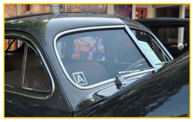
This does NOT stand for Model A!