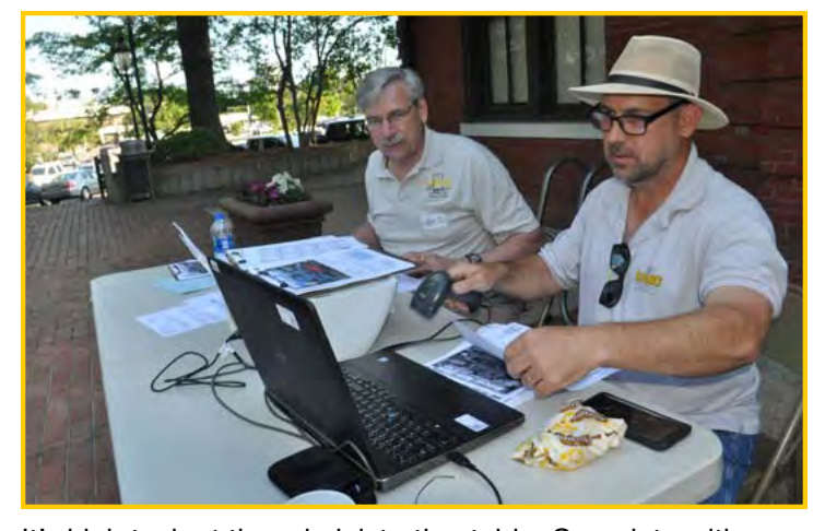
It's high tech at the administration table. Complete with biscuits!