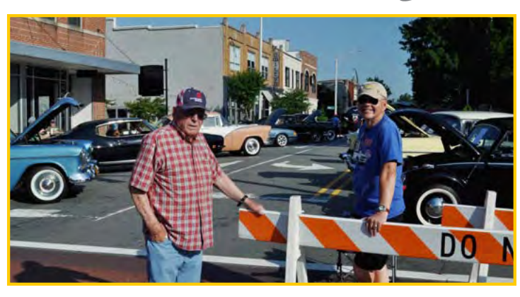
Not just anybody gets by these guys.