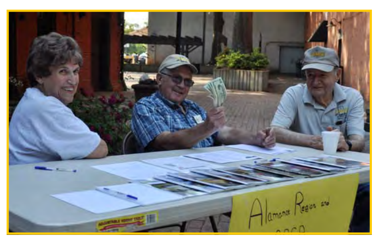
Follow the Money.