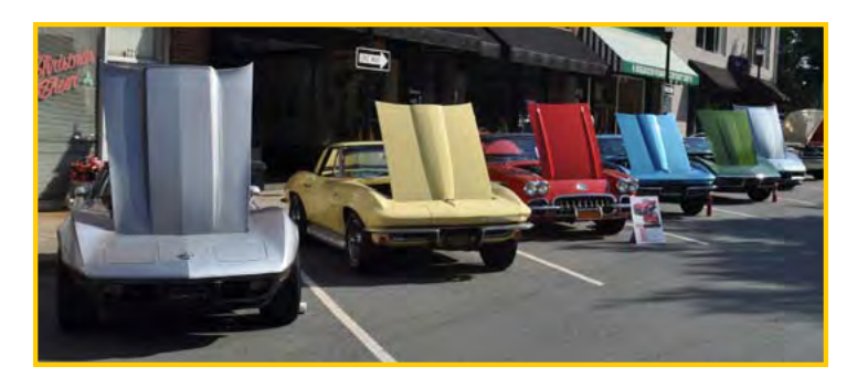
A rainbow of Corvettes at the show.