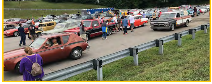
The cars kept coming...