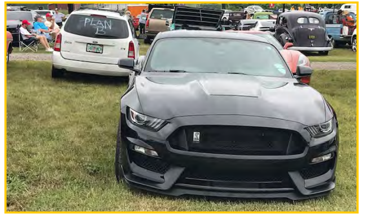
Notice the "Plan B" on the vehicle behind the GT 350.