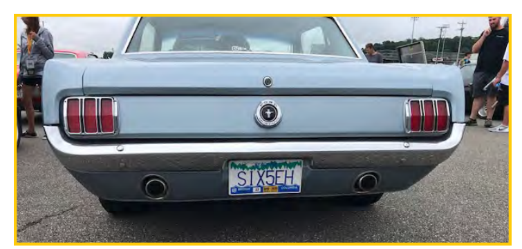
This Mustang was driven from British Columbia.