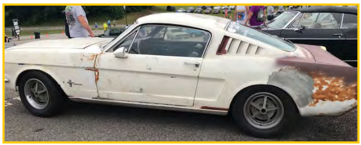
This Mustang was driven from Ontario Canada.