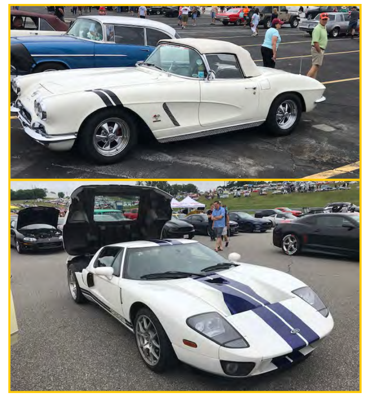
A Ford GT... no cheapie for sure.