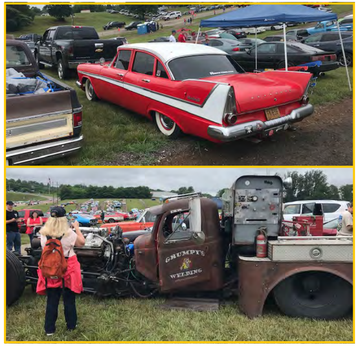
Yes this runs and drives.