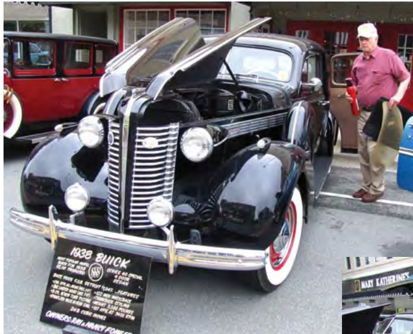
Alamance Region AACA 2018 Antique Car Show