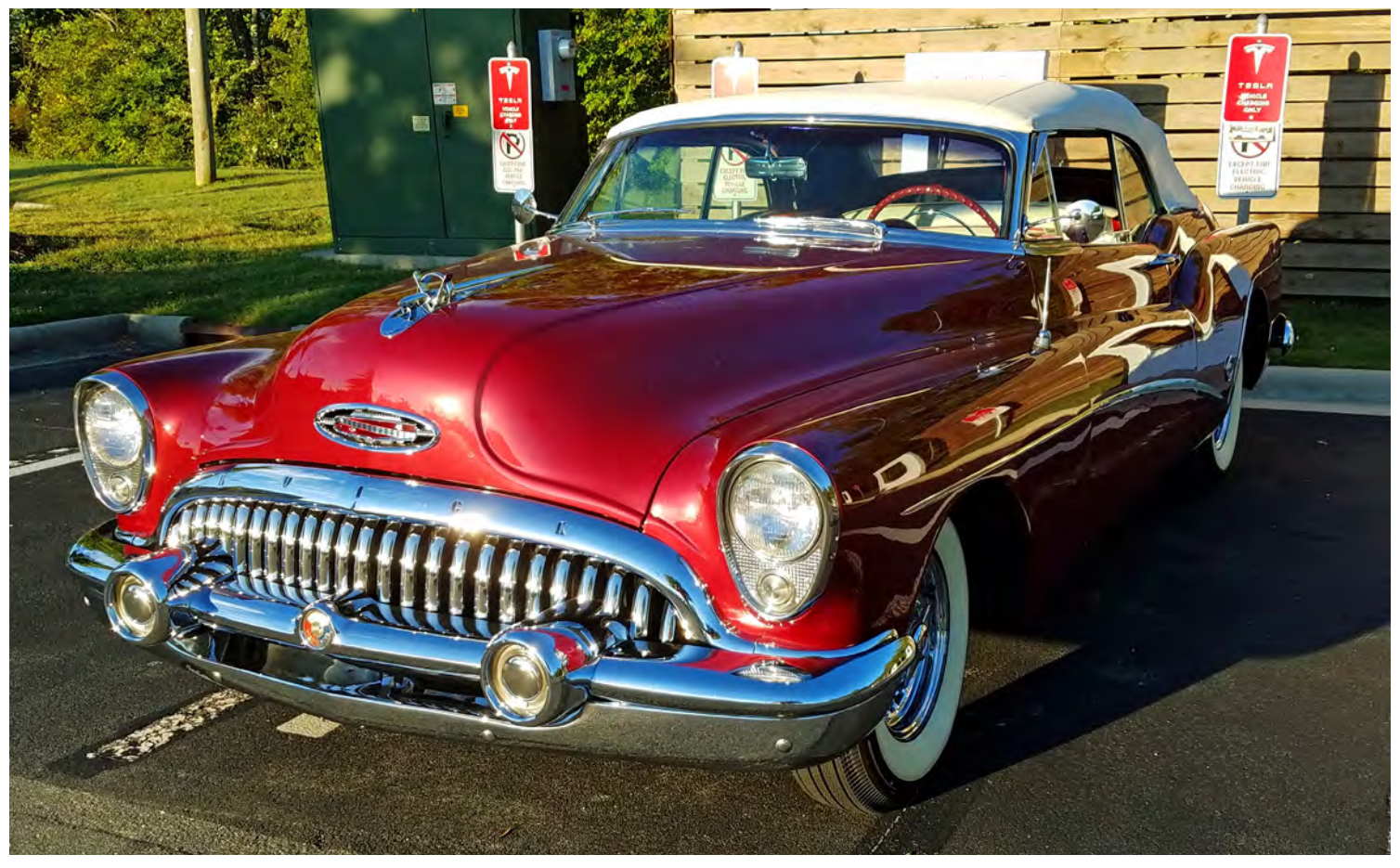
The new 2018 Tesla Model "B" with optional Skylark package.