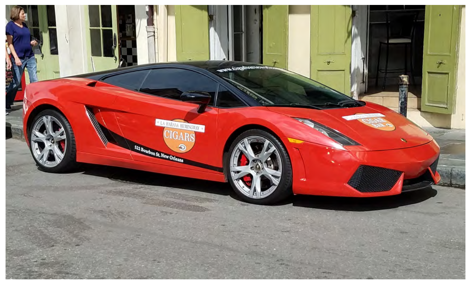
When you're in New Orleans and you need cigars FAST, this is the company you order from.