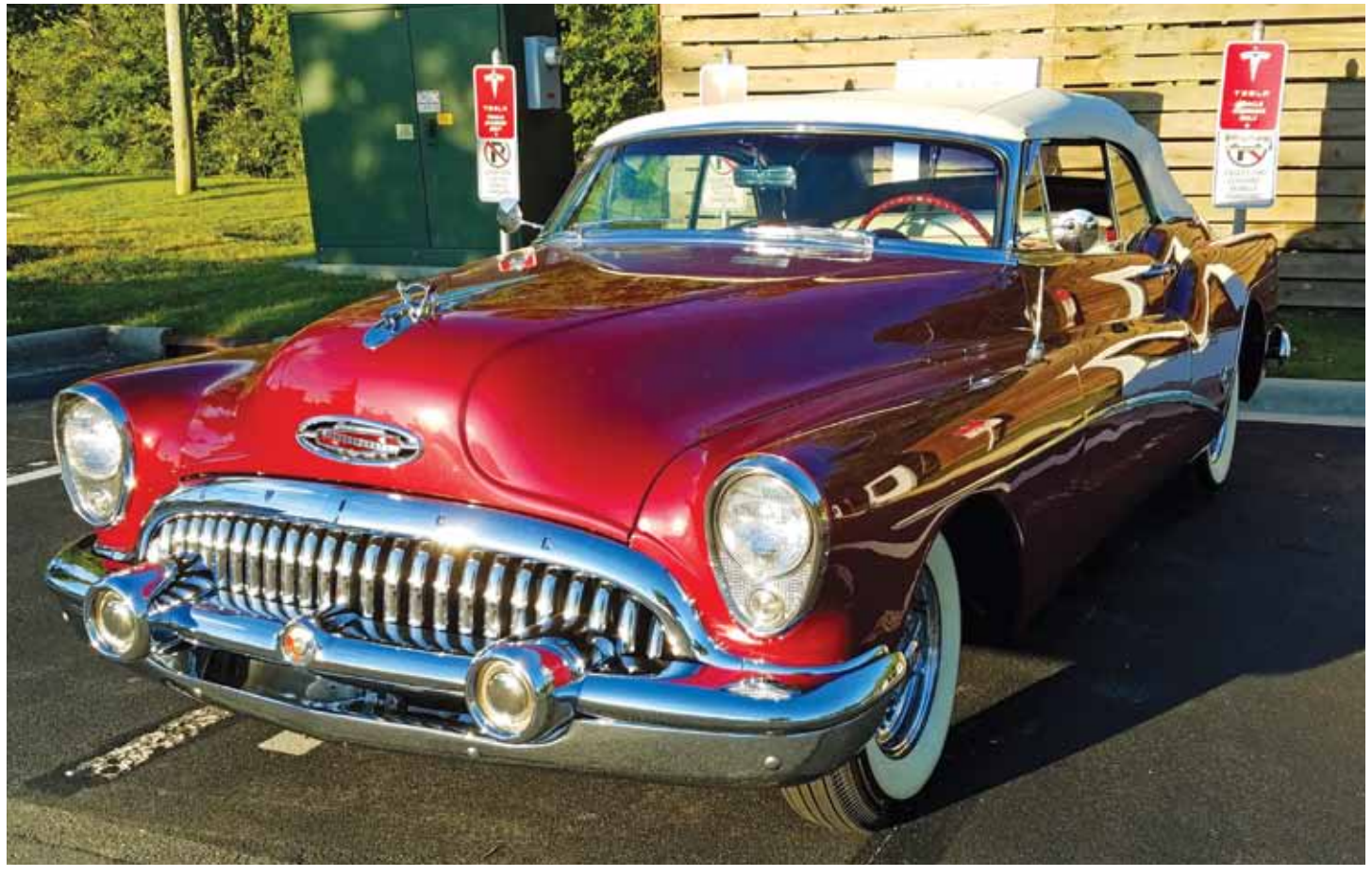
Attached is a photo of the new 2018 Tesla "B" with the popular Skylark package. Ed Tulauskas unfortunately reports that he could not find where it plugs in at the Alamance Crossing Tesla charging station.