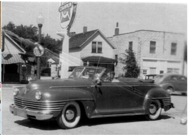
This has to be a rare one! A 1942 Chrysler stopping for a fill-up.