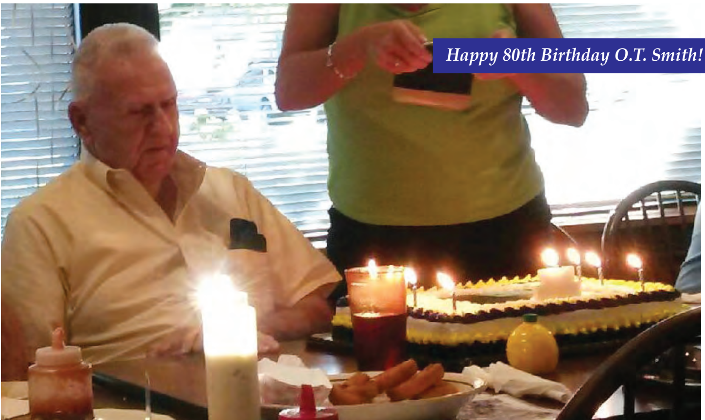
Wait, does that look like 80 candles to you? Somebody is pulling a fast one! Many happy returns O.T.!