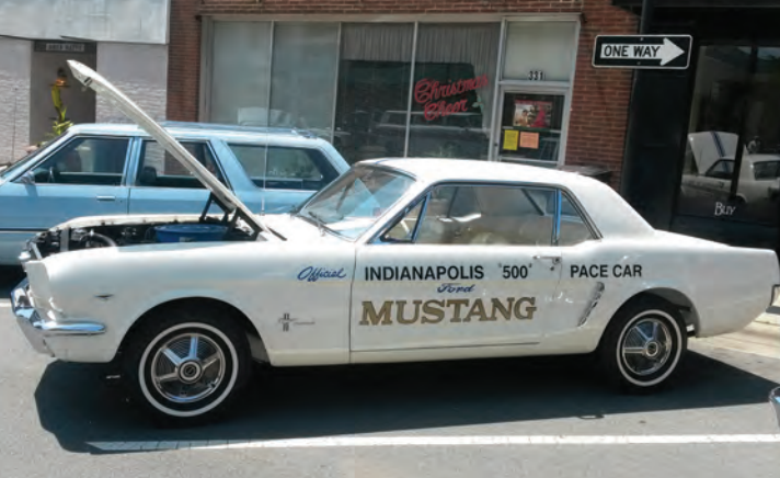
Many\ thanks\ to\ all\ the\ photographers\ who\ documented\ our\ show\ and\ provided\ these\ images\ to\ remember\ it\ by. Yet another enjoyable show under our belts—the 2017 event was a success!