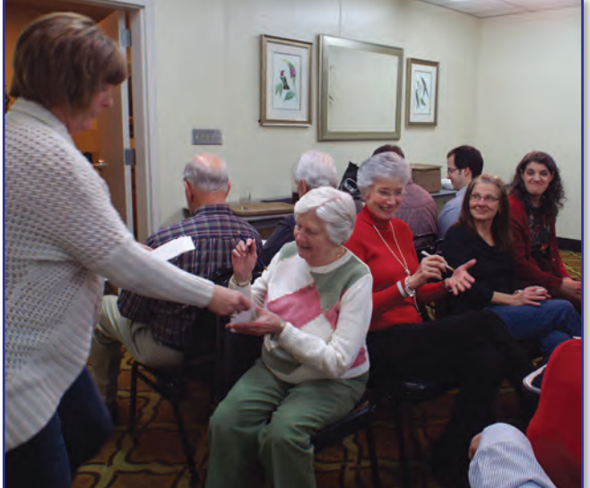
The membership sits in rapt attention (top) as a few select suckers, um, MEMBERS compete in The Embarrassment Game (above and left). Rumor has it that the regulars were bested by a couple newbies. Embarrassment indeed!