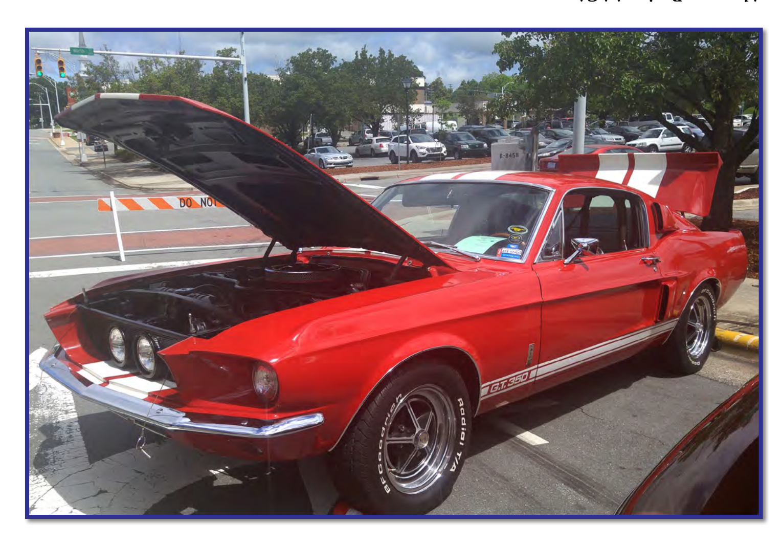
Alamance Region AACA PO Box 565 Mebane NC 27302