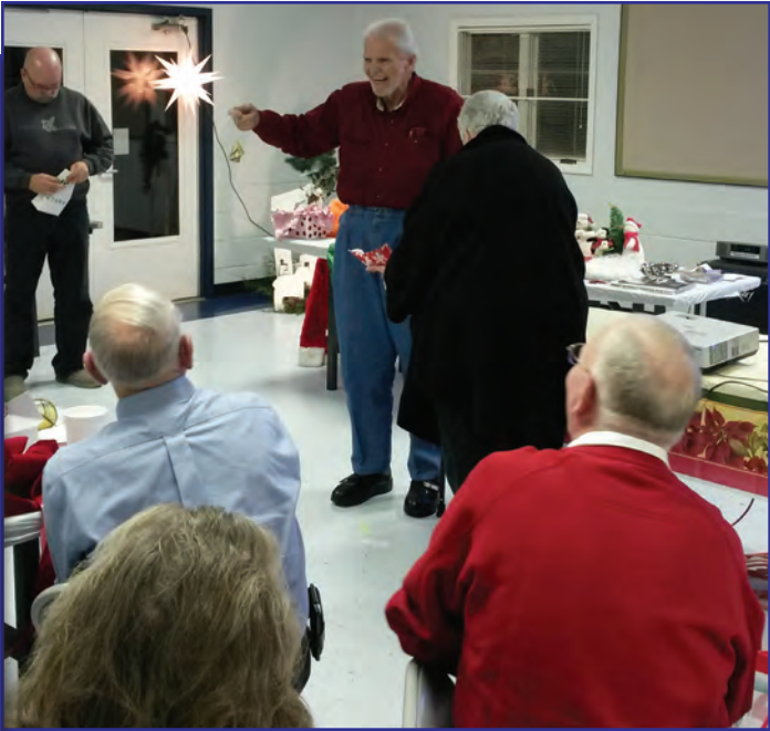
Explaining these photos after the fact would appear to be next to impossible, so just enjoy.