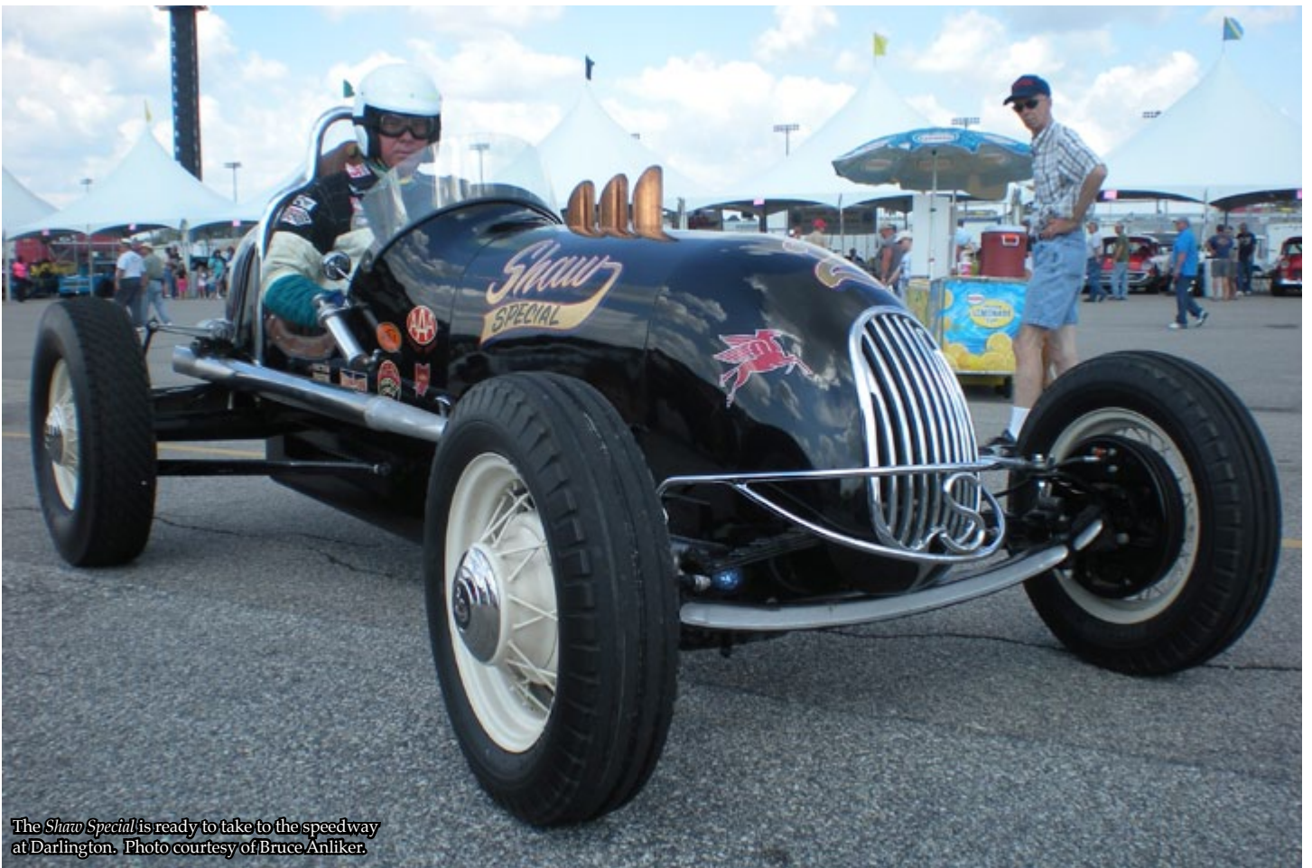
The Shaw Special is ready to take to the speedway at Darlington.

Alamance Region AACA PO Box 565 Mebane NC 27302