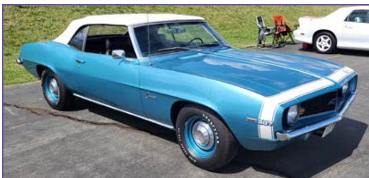
1969 Camaro 307.