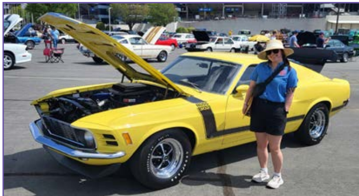
1970 Boss 302.