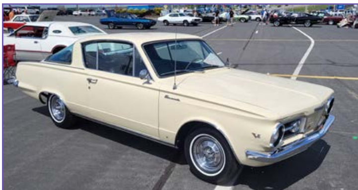
1965 Barracuda V8.