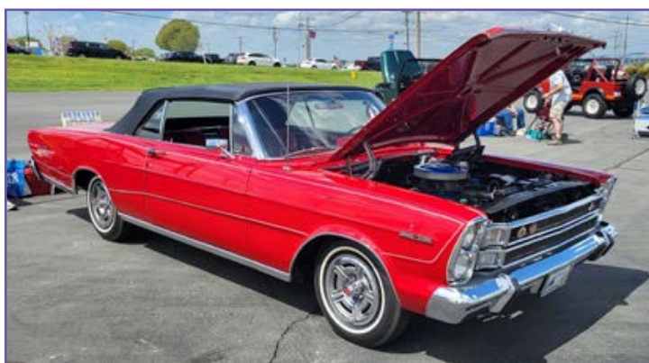
1966 Galaxie 500 7Litre.