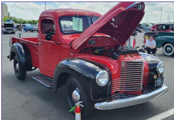
1947 International pickup.