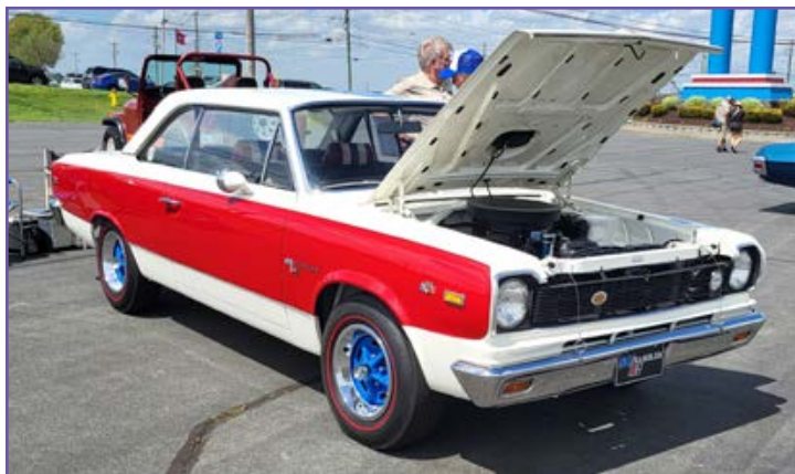
1969 AMC Hurst SC-Rambler.