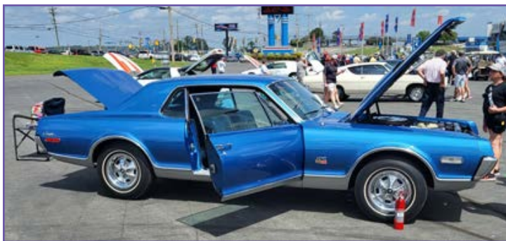
1968 Cougar GT-E 7Litre.