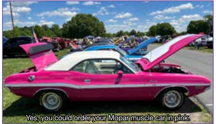
Yes, you could order your Mopar muscle car in pink.