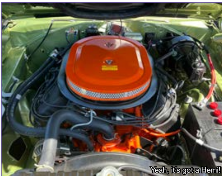
Yeah, it's got a Hemi!