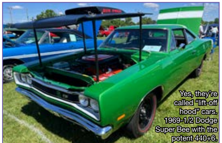
Yes, they're called "lift-off hood" cars. 1969-1/2 Dodge Super Bee with the potent 440+6.