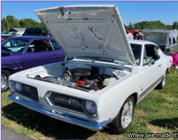
Whew, we made it!