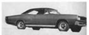
Other members of B.T. are built like steel and more than pull.