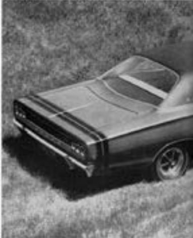
CAR and DRIVER