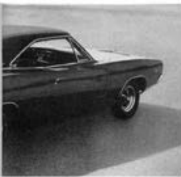
Small, aerodynamic outlines: Chrysler has scaled out.