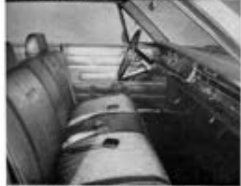
Plastic upholstery is kind of a knockout sport-car effect.