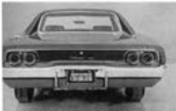
Rear view of Chrysler Dartline reflects influence of European GT products.