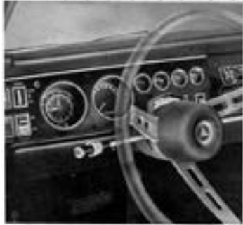
Chrysler's Dartline features nearly complete instrumentation.