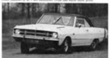
Over 175 hp pulls the '68 Chrysler Dart.