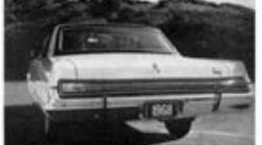
Like GT3, Dartline sets for full-width weight effect.