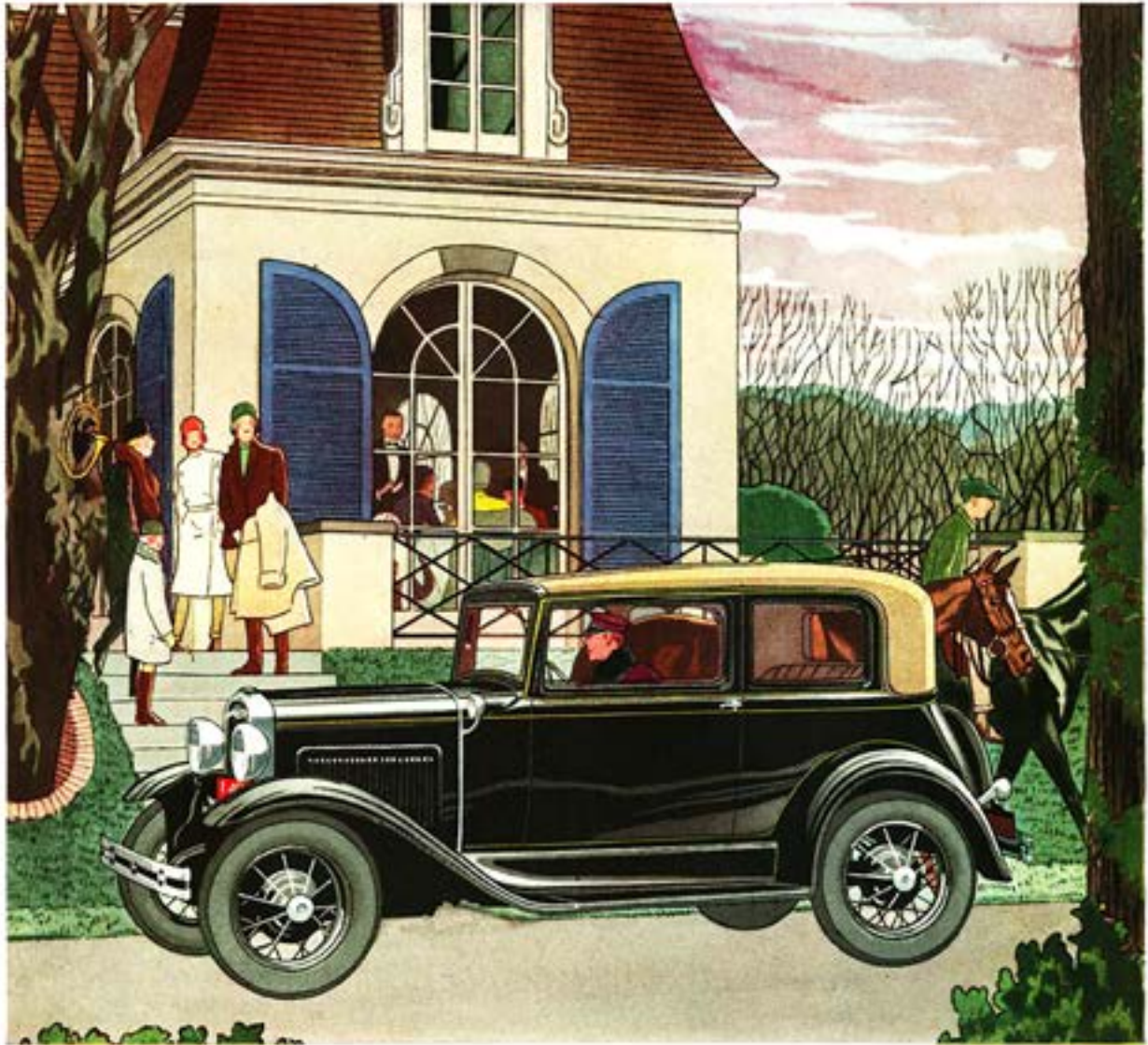
❁ A NEW FORD BODY TYPE OF DISTINCTIVE BEAUTY ❁

THE newest, latest addition to the wide variety of Ford body types is the distinguished four-passenger Victoria. It marks a new degree of beauty and of value in a low-price car.