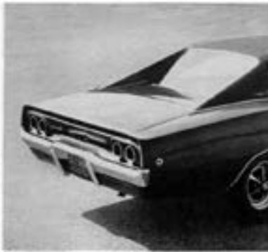
Compacting Chrysler (above) 400 Dodge Coronet B.T. (below).