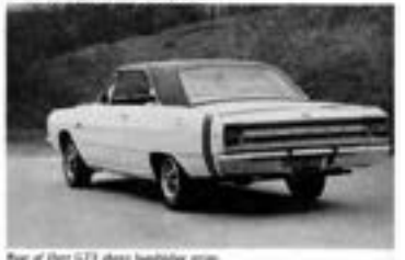
Rear of Dart GT3 shows built-in air.