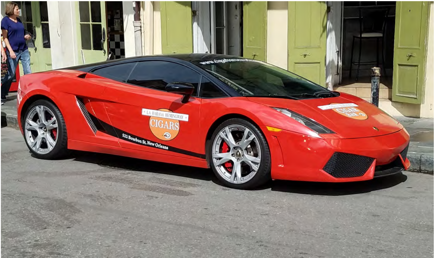
When you're in New Orleans and you need cigars FAST , this is the company you order from.