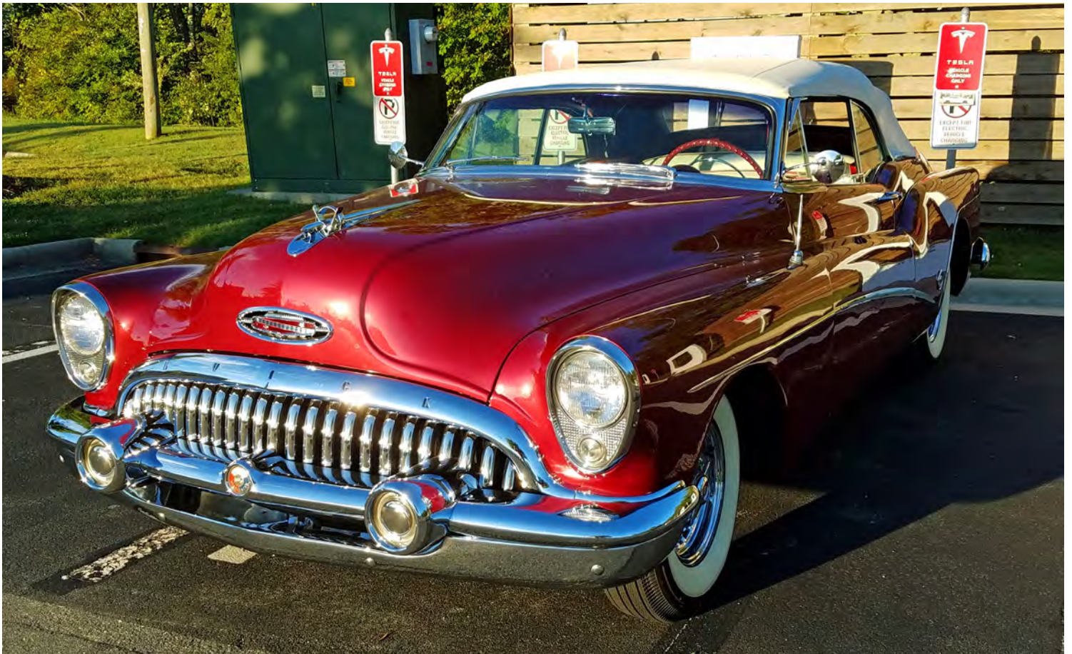
The new 2018 Tesla Model "B" with optional Skylark package.