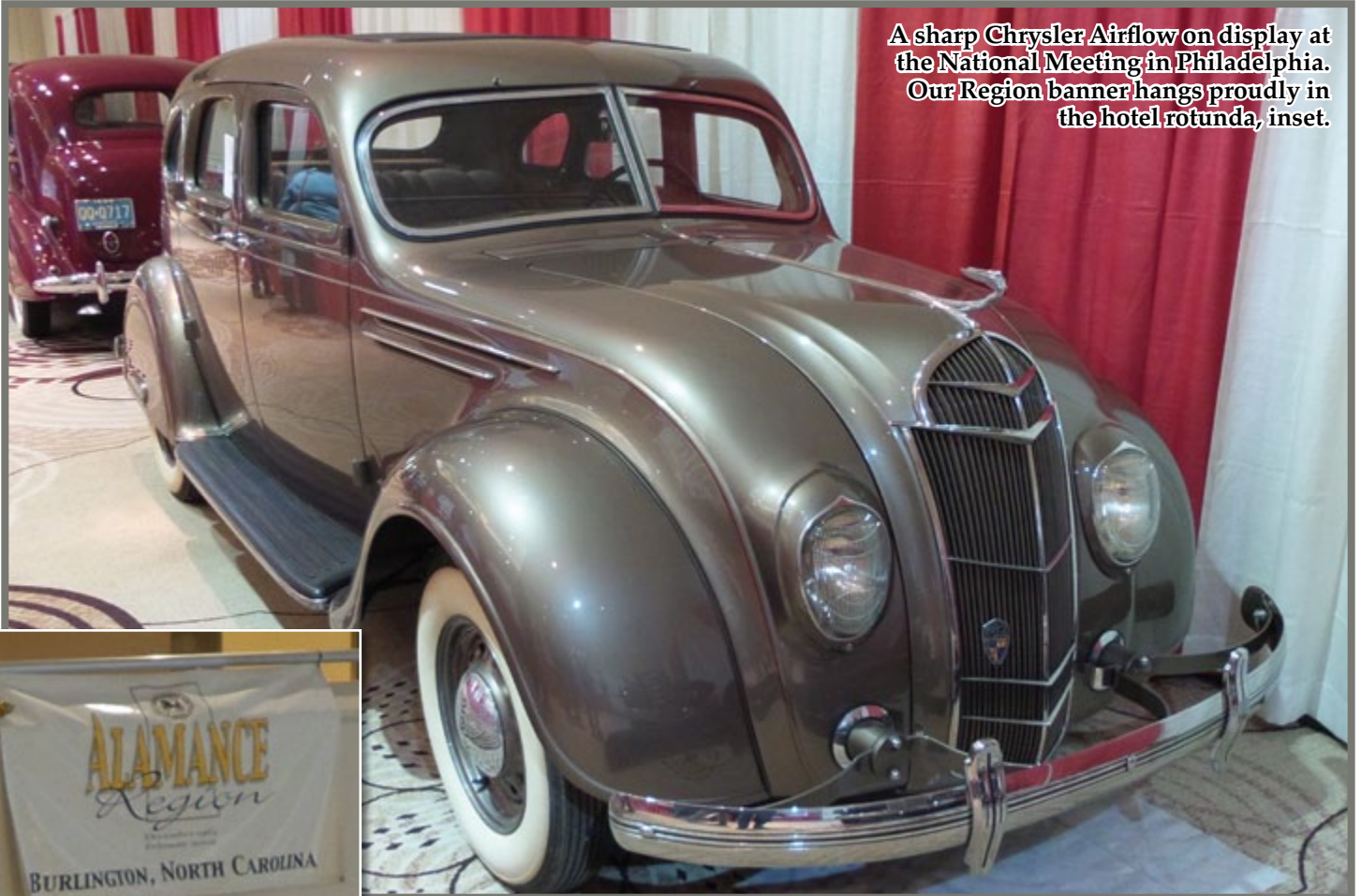
A sharp Chrysler Airflow on display at the National Meeting in Philadelphia. Our Region banner hangs proudly in the hotel rotunda, inset.

Alamance Region AACA PO Box 565 Mebane NC 27302