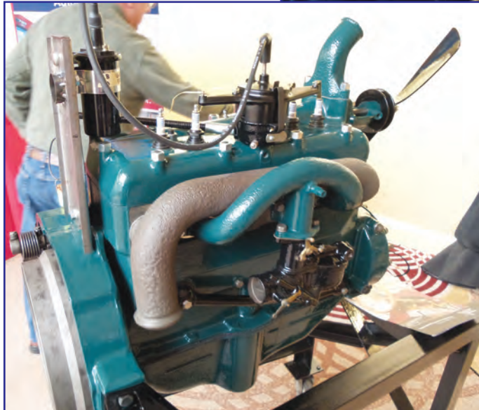
At the hotel in Philadelphia (top). Our Region banner hangs proudly in the hotel atrium (above left). Looks like these young ones are being brought up properly and aren't afraid to get their hands dirty! (above). A nicely restored Model A "banger" on display. (left).