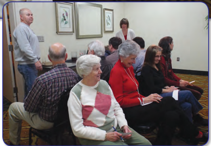
The membership sits in rapt attention (top) as a few select suckers, um, MEMBERS compete in The Embarrassment Game (above and left). Rumor has it that the regulars were bested by a couple newbies. Embarrassment indeed!