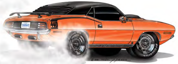
Your intrepid editor and family will be off celebrating all things Mopar at this year's All-Chrysler Nationals in Carlisle, PA this weekend. Sorry we'll miss the meeting, but we're outta here!