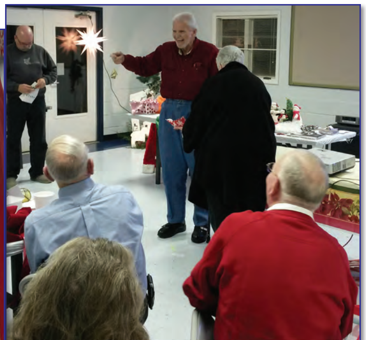
Explaining these photos after the fact would appear to be next to impossible, so just enjoy.